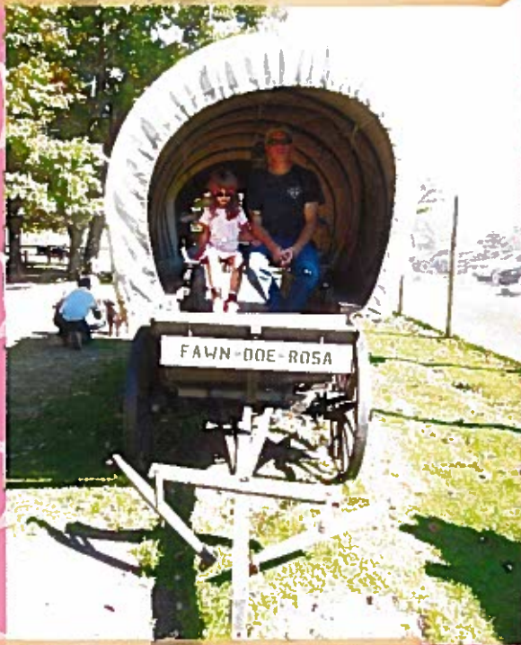
LEARNING MORE ABOUT OUR FAVORITE BOOK SERIES "LITTLE HOUSE ON THE PRAIRIE."