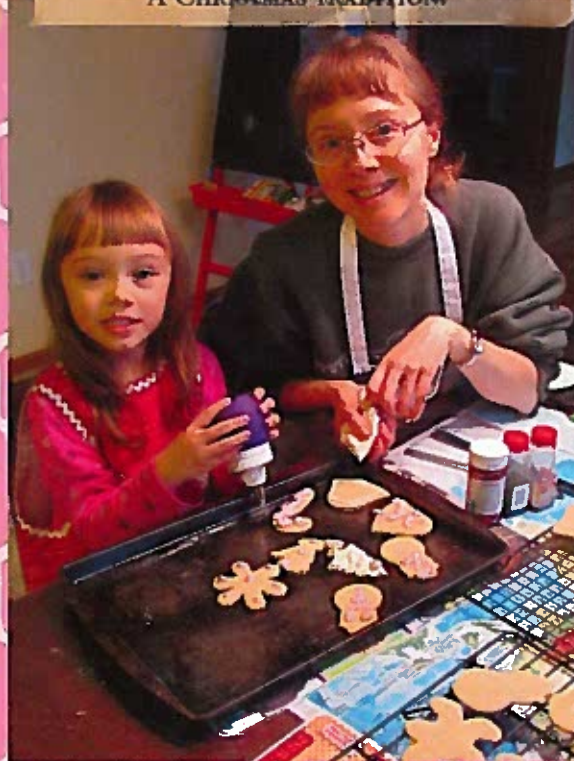
A CHRISTMAS TRADITION!