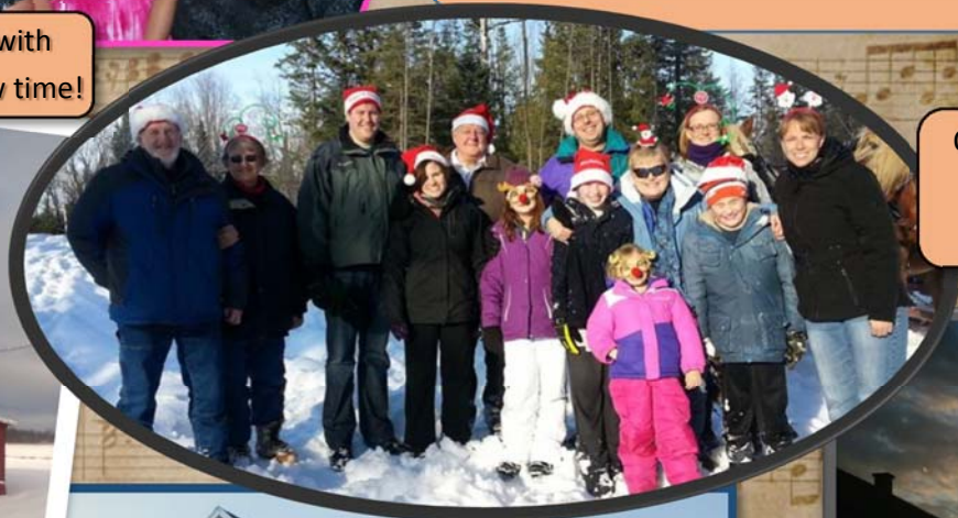
Out for a sleigh ride with the whole family.

Both of our parents reside in Wausau. We enjoy spending holidays and special occasions such as birthdays with our families. When our siblings are in town, we always make time for our traditional homemade buttermilk pancake breakfast. A recent addition to our family traditions is a yearly Christmas sleigh ride. Occasionally we enjoy attending Packer & Brewer games, going golfing, and cruising car & tractor shows together with our families.